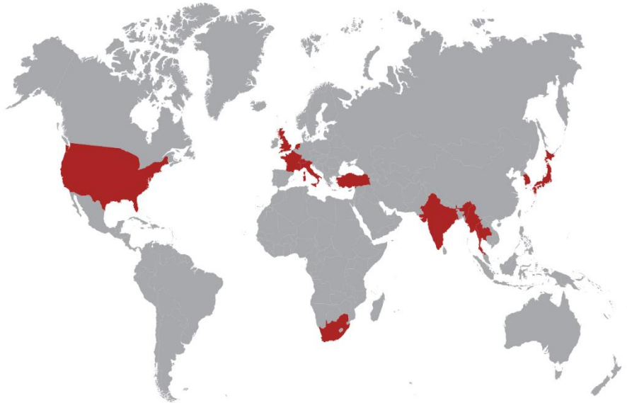
Figure 1: APT41 geographic targeting according to 2022 Mandiant data.

Thailand, Mongolia, Indonesia, Vietnam, Bangladesh, Ireland, and Brunei. The group's espionage campaigns have targeted healthcare (including pharmaceuticals), telecommunications, software and the high-tech sector, media/news, retail, travel, hospitality, sports, education, logistics, finance, entertainment (especially video games) and digital currencies. They are also known to target state governments , which can include healthcare organizations. Much of their targeting has historically included theft of intellectual property, and generally has been observed to align with China's most recent 5-year plan . Their